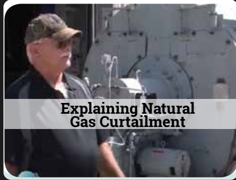
Explaining Natural Gas Curtailment