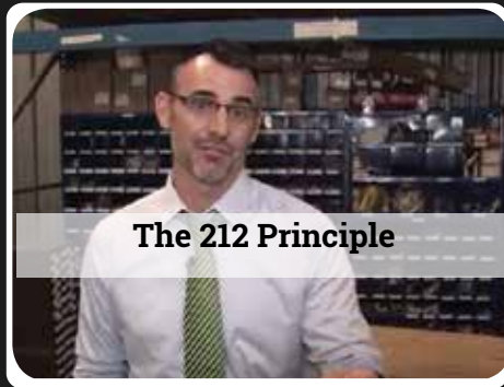
The 212 Principle