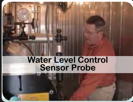
Water Level Control Sensor Probe