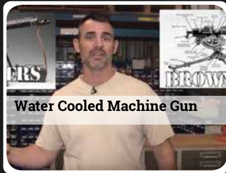
Water Cooled Machine Gun