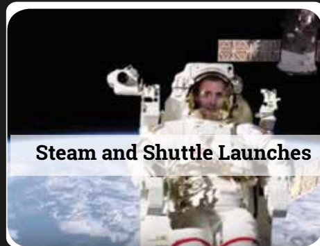
Steam and Shuttle Launches